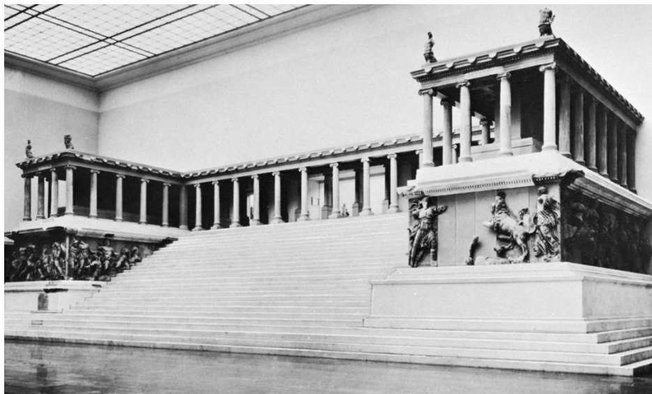
Reconstruction of Altar of Zeus; Pergamum Temple / Throne of Satan

Interestingly, at this museum, there is also a replica of the Ishtar Gate of Babylon, which supposedly traces its roots to Nimrod, the son of Cush and Noah's grandson, who settled in Kenya. Nimrod was the one who left the land of Cush (modern Kenya) to establish Shinar (Babylon).