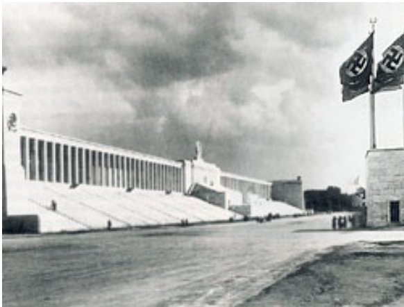
Hitler's Podium at Zeppelin Tribune Field

Many years later, on July 24, 2008, Barack Hussein Obama, who had just seemingly defied all odds and gained enough votes to win the Democratic Presidential nomination, visited Berlin, Germany, where the Throne of Satan exists in the Pergamum Museum. Obama delivered a mesmerizing speech to perhaps 100,000 people. The speech was entitled “The World that Stands as One.” Obama